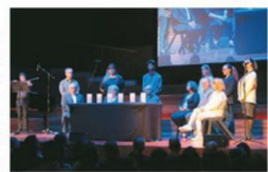
JCCV Yom Hashoah.

"This attack reminds us that 'never again' cannot be a passive phrase. It is an activity that requires courage, effort, and most importantly, all of us ... We will not allow the current heightened levels of anti-Jewish hate to become normalised here in Victoria. We must push it back to the margins of society where it belongs."