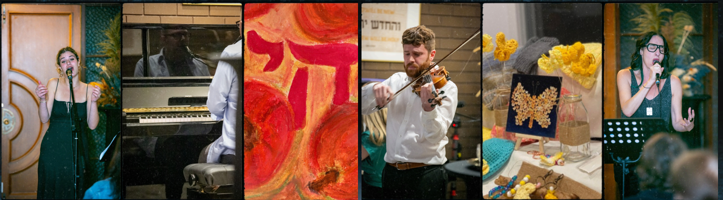
exhibit your work throughout our venue